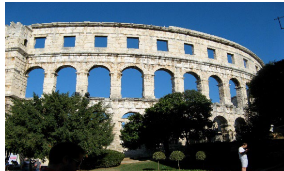
Figure 6: Roman Amphitheatre, Pula, Croatia.

Travel arrangements by: Adventure Canada 1.800.363.7566 extension 1 or 905.271.4000 info@adventurecanada.com Ontario Registration Number: 4001400