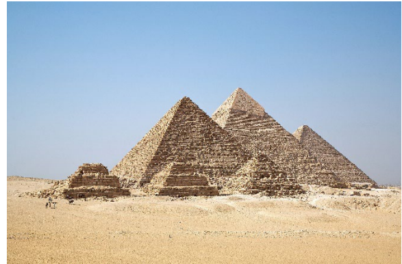
Figure 8: The pyramids at Giza, Egypt. © Ricardo Liberato, Wikimedia Commons, 2006.