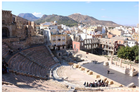
Figure 4: Roman theatre, Cartagena, Spain.

Gastronomical delights, world-class museums, fine wines, magnificent architecture, flamenco, this trip has something for everyone.