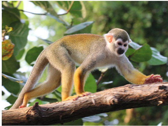
Figure 7: Central American squirrel monkey, Costa Rica.

Explore wondrous rainforests, hard-to-reach indigenous communities and historic Spanish-era towns. See lush flora, exotic birds, and animals from one of the most biologically intense places on the planet, while learning alongside expert guides.