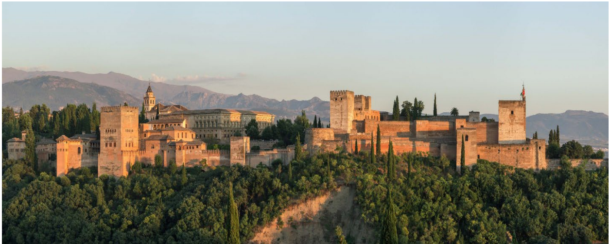
Figure 1: The Alhambra, Granada, Spain.

Relive the history of the Iberian Peninsula in the ancient sites of Roman and Moorish civilizations. Enjoy Spain's beautiful vibrant cities, steeped in history and culture.