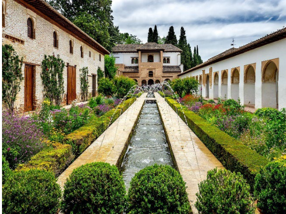
Figure 2: The Court of la Acequia, Generalife Palace, Granada, Spain.

Albaicín and the city, is the main attraction. One of the most famous achievements of Islamic architecture, it is a delight to the senses with its aromatic gardens, its beautiful fountains and reflective pools, lace-like carvings and tile mosaics.