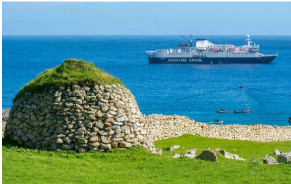
Figure 5: "Ocean Endeavour" anchored off Saint Kilda, Scotland.

Thread your way through the enchanting Scottish islands. Watch the mist rise to reveal dramatic mountains and secret caves. Walk in history's footsteps, from Neolithic standing stones, to Iron Age brochs, to Norse ruins. Drop into a pub for a dram of magnificent whisky before a peat