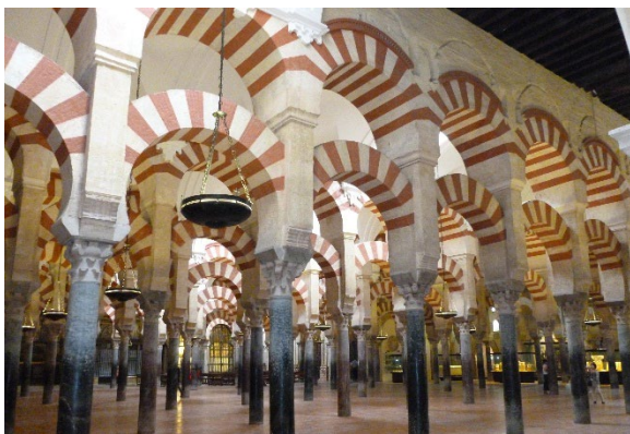
Figure 3: La Mezquita, Cordoba, Spain. Ann Dandy, 2012.

In Córdoba, the Mezquita, with its forest of red and white arches and a Christian cathedral rising from within, is a living expression of the existence of different cultures.