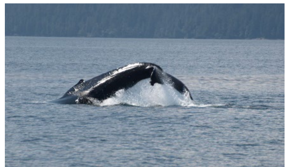
Figure 11: Humpback whale, Hecate Strait, Haida Gwaii.

We enjoyed an abundance of marine and wildlife such as sea lions, whales, bald eagle, albatross, black bear, crabs, and sea stars. Watchmen, the on-site guardians of five sacred sites including UNESCO World Heritage site SGang Gwaay, told stories of their ancestors' lives and pointed out remains of poles, house pits, and longhouses.