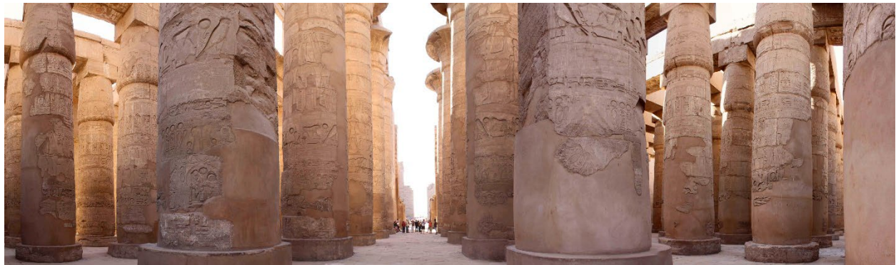
Figure 9: The great hypostyle hall at Karnak, near Luxor, Egypt.